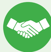
Partnerships and Linkages