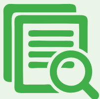
Research & Documentation